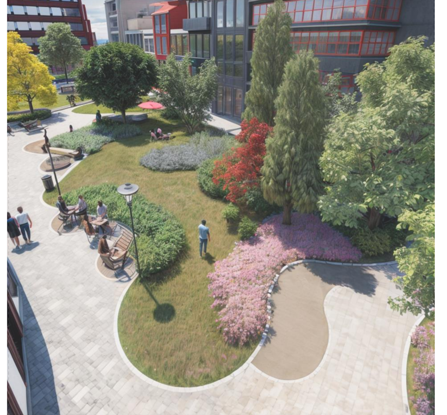
Eye-level Simulation 3