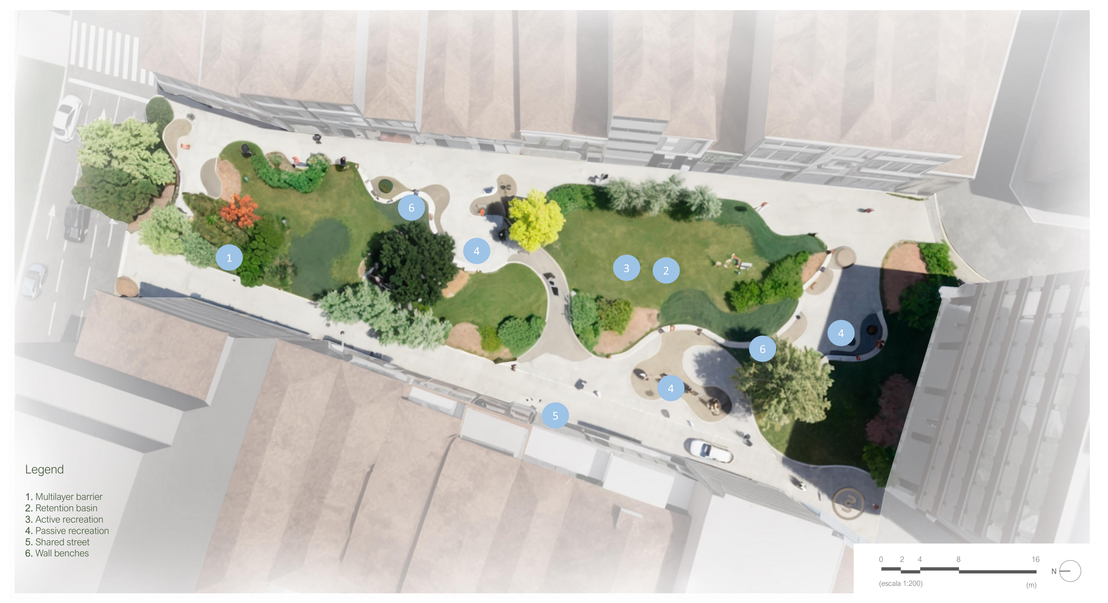
Diagram / concept sketch title

The proposal affirms the creation of an imponent green space that penetrates the urban grid, bringing nature back to the city. Therefore, Dr. Tito Fontes Square is transformed into a dynamic ecosystem, where nature is celebrated and reintegrated into the urban experience, through a sustainable and harmonious puzzle that provides living areas thar interact with the built space, with people their social needs and the natural environment.